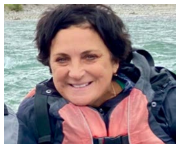
New Fund: Holly Bess Community Fund