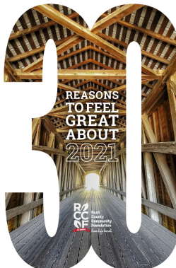
Read Your Annual Impact Report