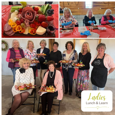
Reunited: Ladies & Lunch Event

Here are the top stories from last month.