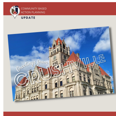
CBAP Update: Greetings from Crushville